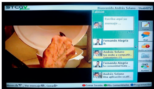
Figure 2. List of messages posted to the blog.