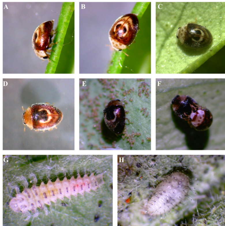
Figure 1. Stages of Clitostethus arcuatus (Rossi) (Coleoptera: Coccinellidae) on citrus leaves. (A-D) Lateral and dorsal view of adults. (E) Adult feed on eggs, (F) Sexual dimorphism, copula of C. arcuatus . (G) Dorsal view of larva, and (H) pupa of the ladybird.