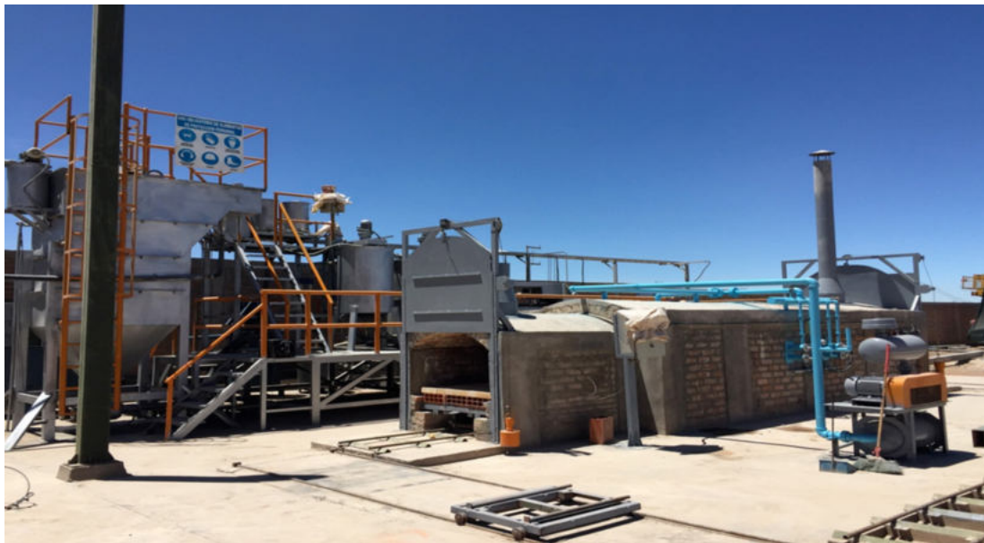
Figure 2. Prototype for bricks manufacture.

designed and built for this component: a feeder tank and a push system. The first one mix tailings coming from the field by using the Magnafloc flocculant and takes them to the Lamella Thickener. The pump system moves the solid part of the tailings mixture to the conditioning tank, which conditions the sedimented tailings, achieving a concentration of solid of around 30%. The product then moves in the neutralizing tank, where the cyanide is neutralized through the addition of Caro's acid, until it meets the environmental quality standards of 0.1 mg/L in the liquid part of the tailings mixture.